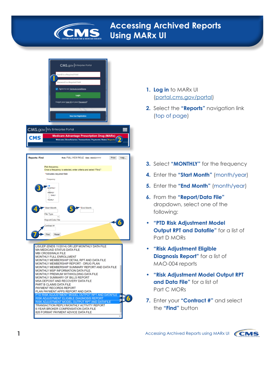
Figure 1: Accessing the MAO-004 Report on the MARx UI Job Aid